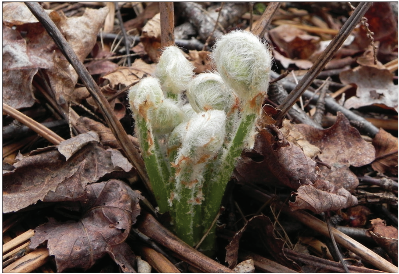
Fiddleheads in a spring forest.

site conditions. Soil characteristics, hydrologic conditions, topographic variation, and other characteristics may provide conditions that retain habitat for native species and resist invasive species. Existing ecosystems may be more easily maintained at sites with these unique conditions. An example of an adaptation tactic under this approach that focuses on prioritization is to identify unique sites that are expected to be more resistant to change, such as spring-fed stands sheltered in swales, and emphasize maintenance of site quality and existing communities. A more active adaptation tactic is to identify a suite of potential sites for refugia and commit additional resources to ensuring that the characteristic conditions are not degraded by invasive species, herbivory, fire, or other disturbances.