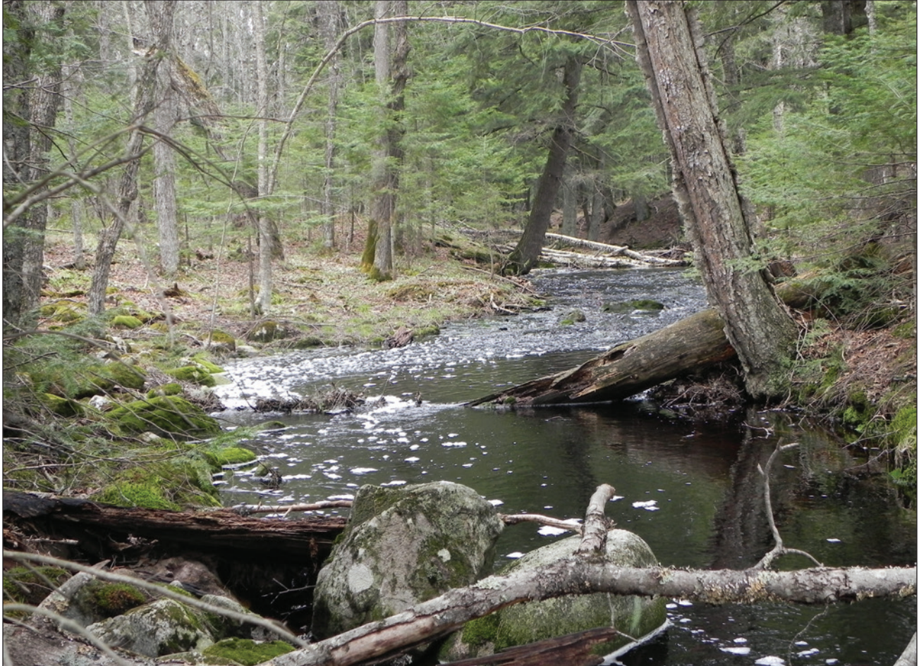
A stream winding through a northern hardwood forest.