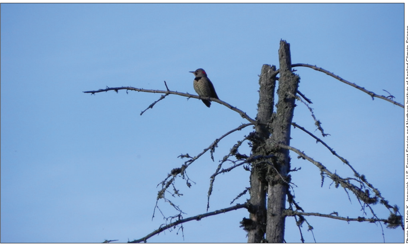
A northern flicker on the branch of a dead tree.