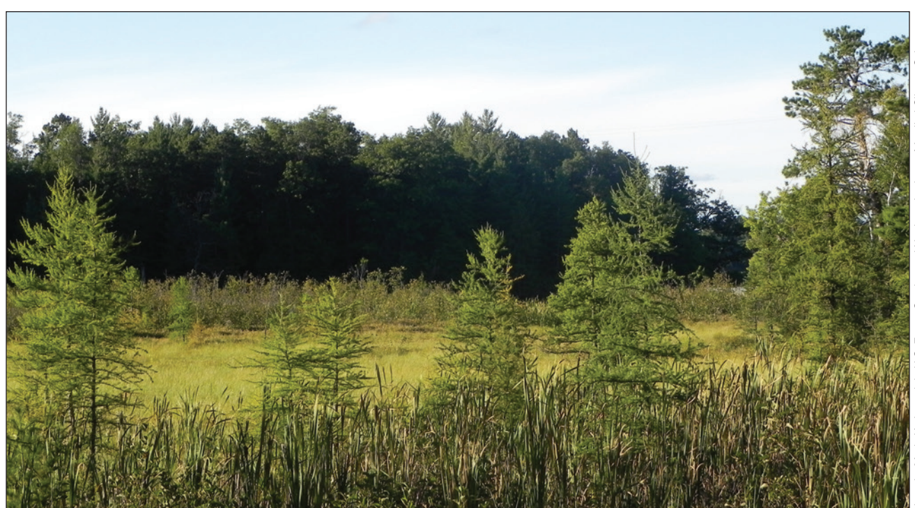
Tamarack trees on the edge of a small peatland.

abundance of many forest insects and pathogens (Ayres and Lombardero 2000, Dukes et al. 2009). These impacts may be exacerbated where site conditions, climate, other stressors, and interactions among these factors increase the vulnerability of forests to these agents. Actions to manipulate the density, structure, or species composition of forests may reduce the susceptibility of forests to some pests and pathogens. One example of an adaptation tactic under this approach is to discourage infestation of certain insect pests by reducing the density of a host species and increasing the vigor of the remaining trees. Another example is to maintain an appropriate rotation length to decrease the period of time that a stand is vulnerable to insect pests and pathogens (Spittlehouse and Stewart 2003), recognizing that species are uniquely susceptible to pests and pathogens at various ages and stocking levels. Existing management tactics can also be used to reduce the susceptibility of forests to insects and diseases that may be exacerbated by climate change (Coakley et al. 1999).